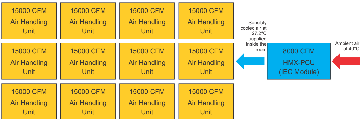
Schematic of Lupin, Pune, Service Floor