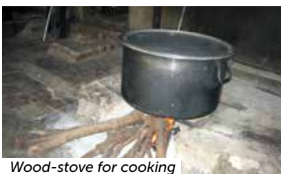
Wood-stove for cooking