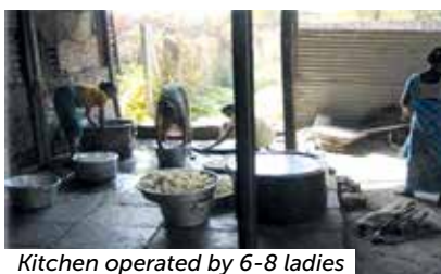
Kitchen operated by 6-8 ladies