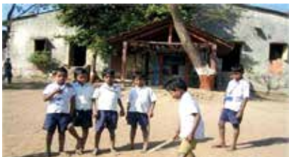
Resident tribal school for 450 children

The management at NLC invited A.T.E. to demonstrate their integrated solar-assisted steam cooking system. The A.T.E. team systematically addressed several requirements and offered a solution that integrated energy efficiency and renewable solar thermal energy. The CST-based steam cooking solution also include (i) A UPS backup system for the feed water pump and PLC operation;