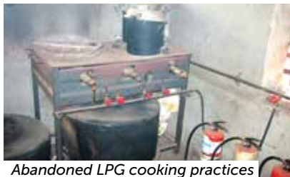
Abandoned LPG cooking practices